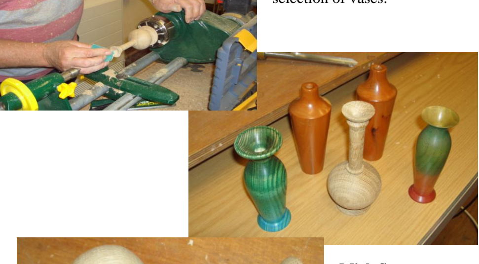
Mick Smets Bud Vase

flare for design with an oriental flavour. In the photographs is a selection of vases.