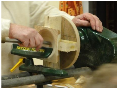
hollowing out the bowl

Now you will need a jig like Mick's to hold your workpiece whilst you remove that waste wood and hollow out the bottom of the bowl.