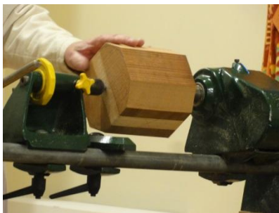
The three pieces glued together. Corner sawn off to save time

Mount the three piece block in the lathe with the scrap piece in the centre. Turn up a cylinder.