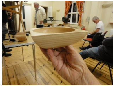
The finished square bowl