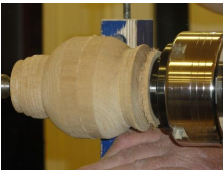
Gradual cutting of the outside