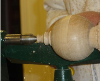
Polishing the final shape