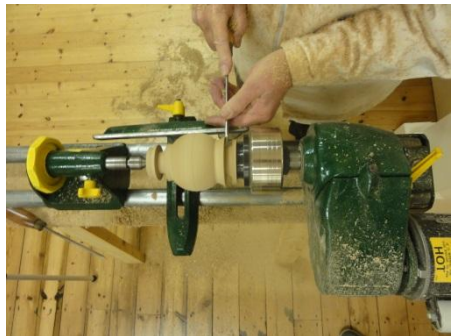
Putting a base and finial on the ball