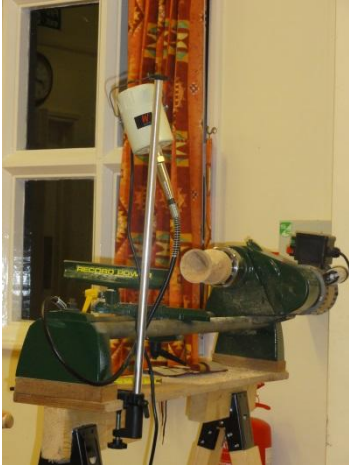
Power drive for cutter

Marking out the flute positions was tricky as the clubs lathe used on this occasion did not have an indexing system.