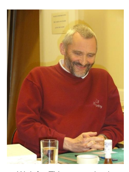
Wait for TV to come back on

1. Start with the full design on a piece of paper. Attach this to the background sheet.