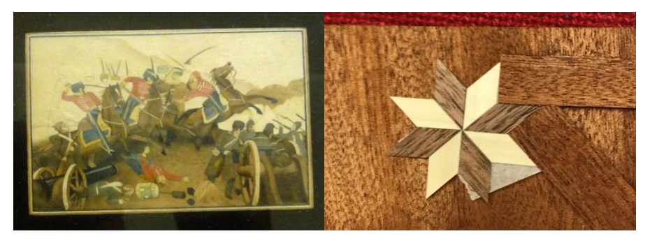
From the complex to the simple

Note: supplies of veneers can be obtained from: