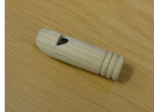
The finished whistle

Now make a small tight fitting plug to neatly fit the 15mm diam. hole. Cut away the windway off the plug ( see drawing for dimensions). Push into whistle and blow. On the night three out of four worked first time. Now that wasn't luck but the genuine skill of our members. All the whistles gave off the same note more or less. It was at this point that someone suggested we try to make a recorder.