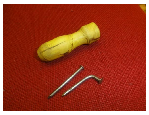
Nick's nearly finished handle with just a nail to be inserted.

The key to a successful opener is the bent nail. This is apparently rather difficult to achieve. You need to hold the nail in a vice and then tap or use pliars to obtain the hook shape. The handle is drilled to take the nail but allow for a final tap in. The nail is held in place permanently with glue.