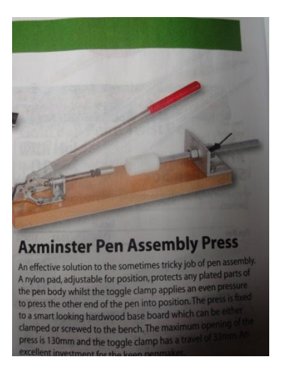
Axminsters version @ £45