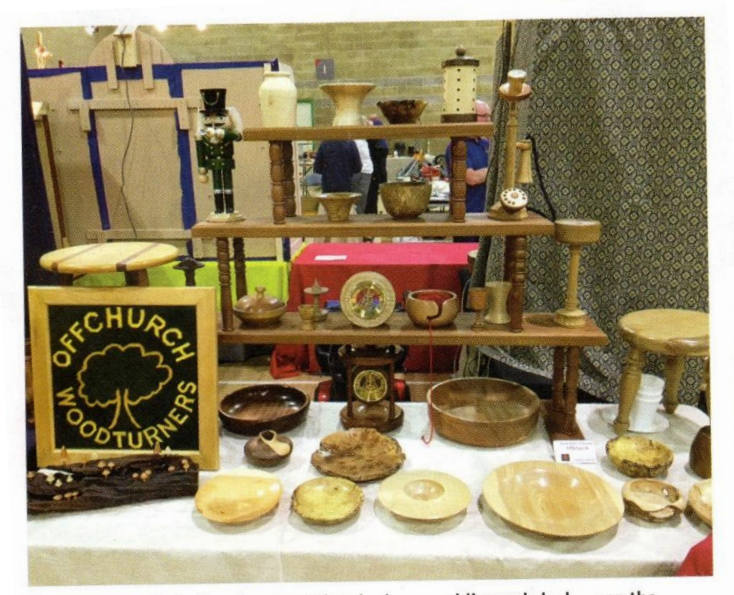
The turnings – including the old-style telephone, soldier and clocks – on the Offchurch Woodturners' stand certainly caused people to stop and look

The woodworking show at Daventry got good coverage in Woodturnng magazine. This is our only good local show these days and quite a few members attended. Not only did members go but we put on a stand and got a mention in the mag.