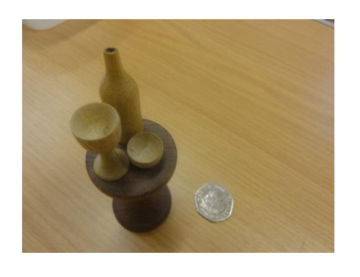
Note the coin alongside to give scale.